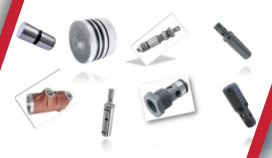
H. M. T. ( Zetor ) Tractor Parts