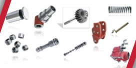
Ford Farm Trac Tractor Parts